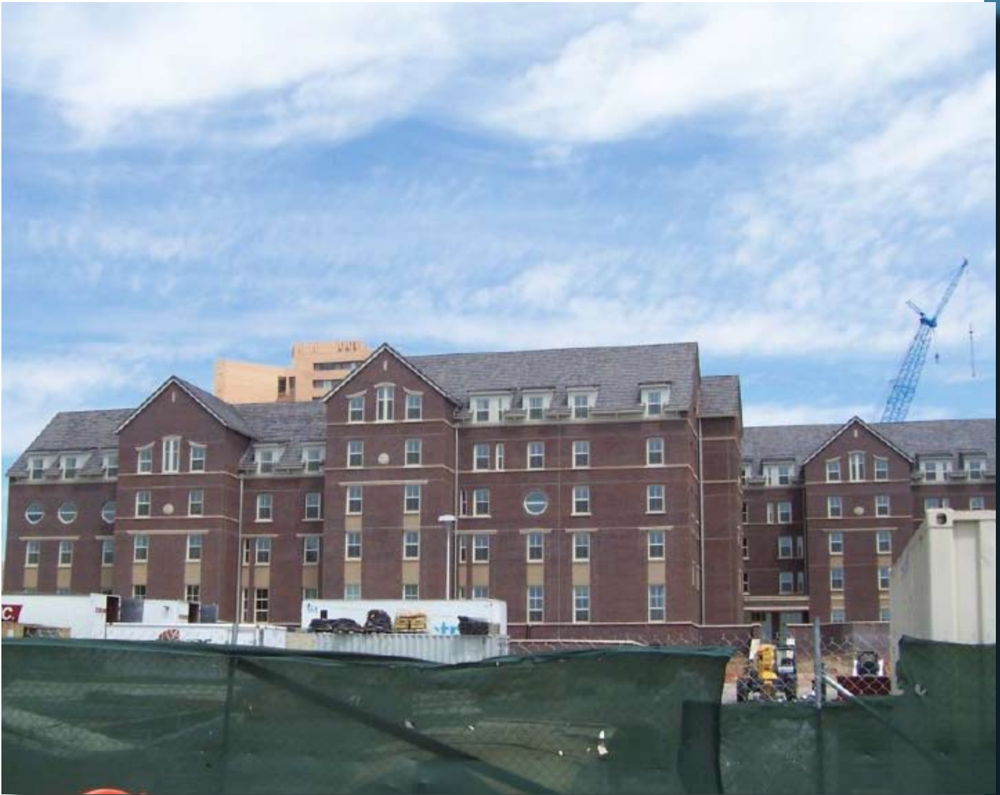
Above Image: Full scope of project.

With the combined efforts of CDI and TEAM Panels, Phase I came in on schedule, and students began occupying the new building for the 2008 fall semester.